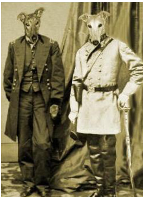
Poster for Greyhounds in Gettysburg