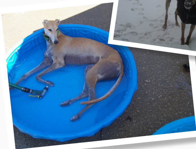
Beach bunny Kemo

Ironically she is from a track in Naples, Florida.